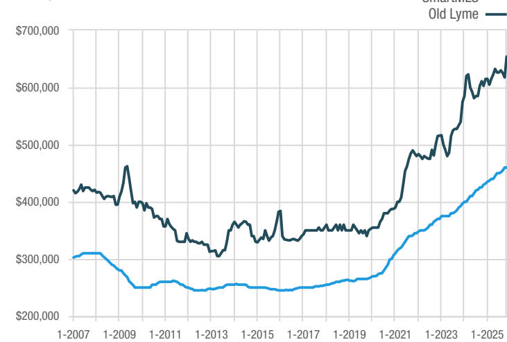
Median Sales Price - Single Family Rolling 12-Month Calculation