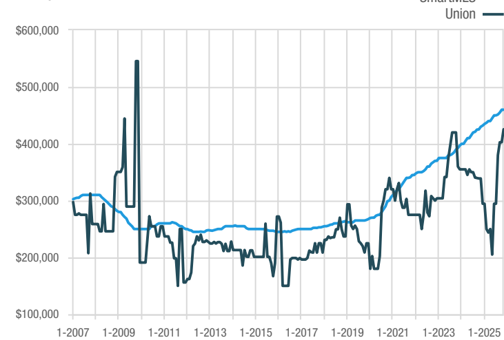
Median Sales Price - Single Family Rolling 12-Month Calculation