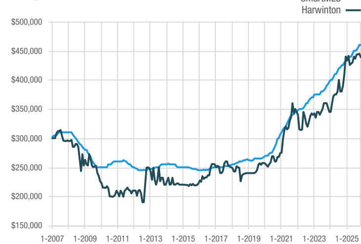
Median Sales Price - Single Family Rolling 12-Month Calculation