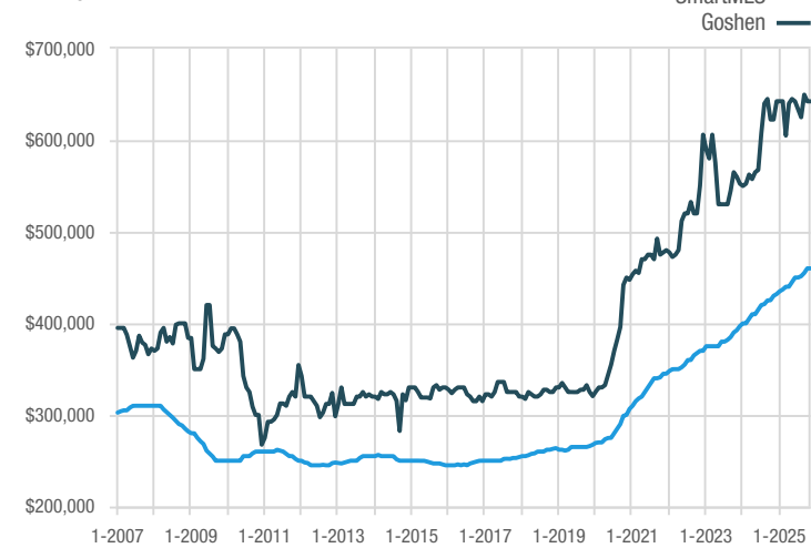
Median Sales Price - Single Family Rolling 12-Month Calculation