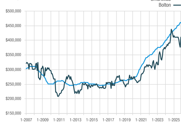
Median Sales Price - Single Family Rolling 12-Month Calculation