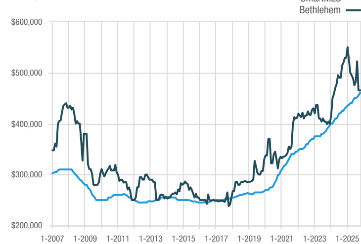
Median Sales Price - Single Family Rolling 12-Month Calculation